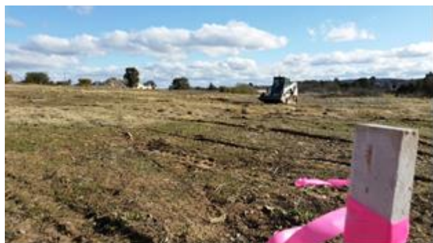
Survey pegs on the site

Some clearing and preliminary survey works have been carried out to assist with the assessment of the preferred location.